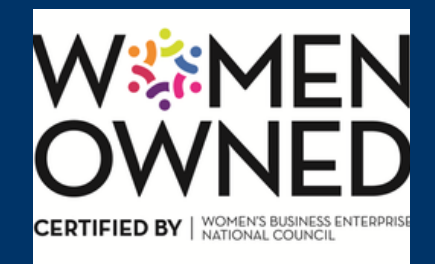
CIG granted certification as a Woman-Owned Business by WBENC.